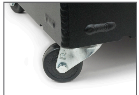
Casters For Easy Transit

Standard interior volume is 444.5 mm wide x 393.7 mm deep x 342.9 mm tall. Custom sizes and options such as robust tie downs and lifting points are quickly deployed.